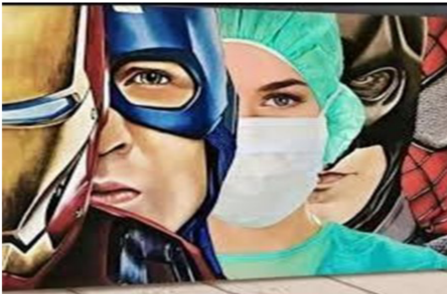
Figure 4 – Nurse as a member of the masked heroes team