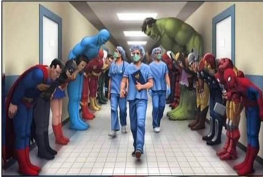
Figure 3 – Super heroes bow in respect to Nursing professionals