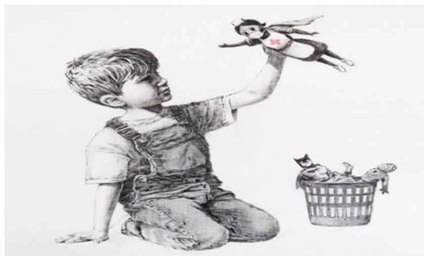
Obra de Banksy mostra um menino que tem nas mãos uma heroína: uma enfermeira - JN