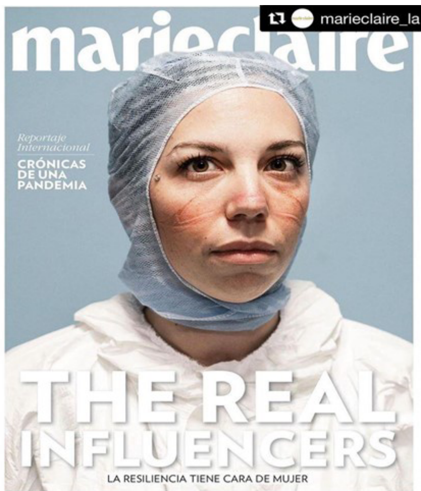
Figure 5 – Women of health become the cover of a Mexican magazine: 'true influencers'