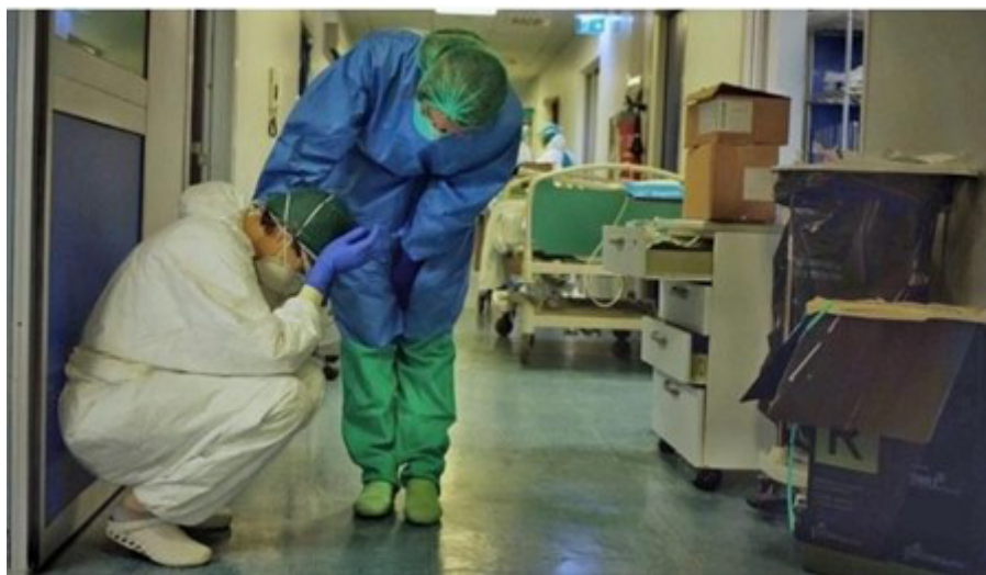
Figure 6 – Nurse photographs the impact of the coronavirus on hospitals in Italy