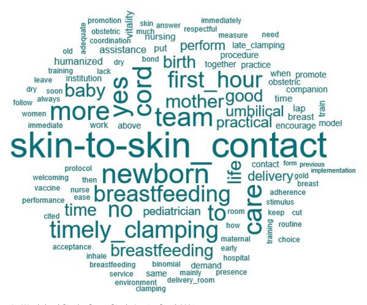
Figure 1 – Word cloud. Rio das Ostras, Rio de Janeiro, Brazil, 2021

In the Similitude Analysis, active forms with recurrence of six or more times were included, enabling to identify the words and the connections (links) between them. Thus, the