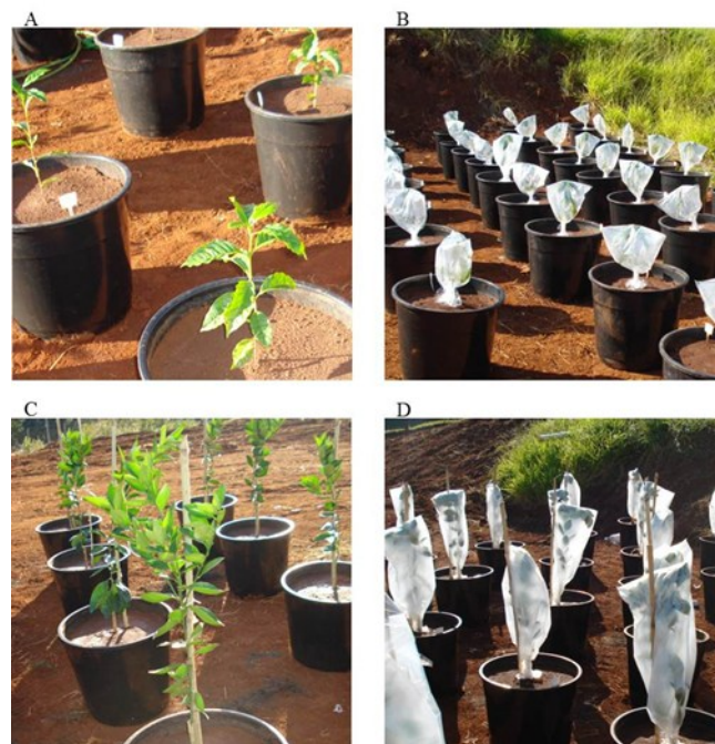
Figure 1. Coffee (A) and orange (C) plants at the first application of the chemical treatments; coffee (B) and orange (D) plants covered with plastic bags, prepared for receiving the first application of chemical treatments. Botucatu, SP, 2012/13.