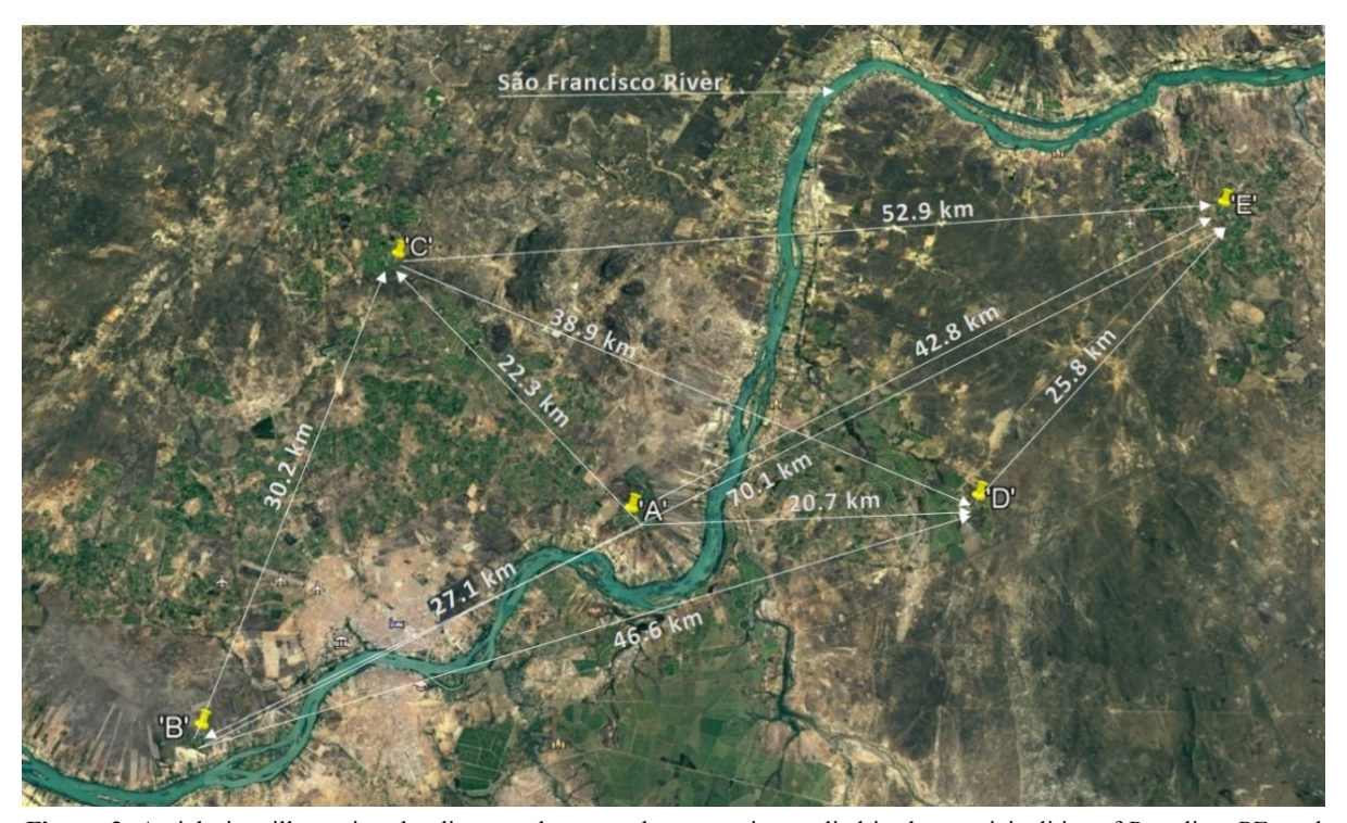
Figure 3 . Aerial view illustrating the distances between the properties studied in the municipalities of Petrolina, PE, and Juazeiro, BA, in the Mid-Lower São Francisco River Valley, Brazil. Altitude of the viewpoint: 71.41 km.

The overall analyses of properties showed that C. benghalensis was the most important weed species, with higher IVI in four of the five properties evaluated, and IVI of 32.2% in the overall analysis (Table 7). The second and third most important species had IVI of 12.1% ( E. hirta ) and 10.2% ( C. aggregatus ). T. fruticosum, A. deflexus , and P. niruri