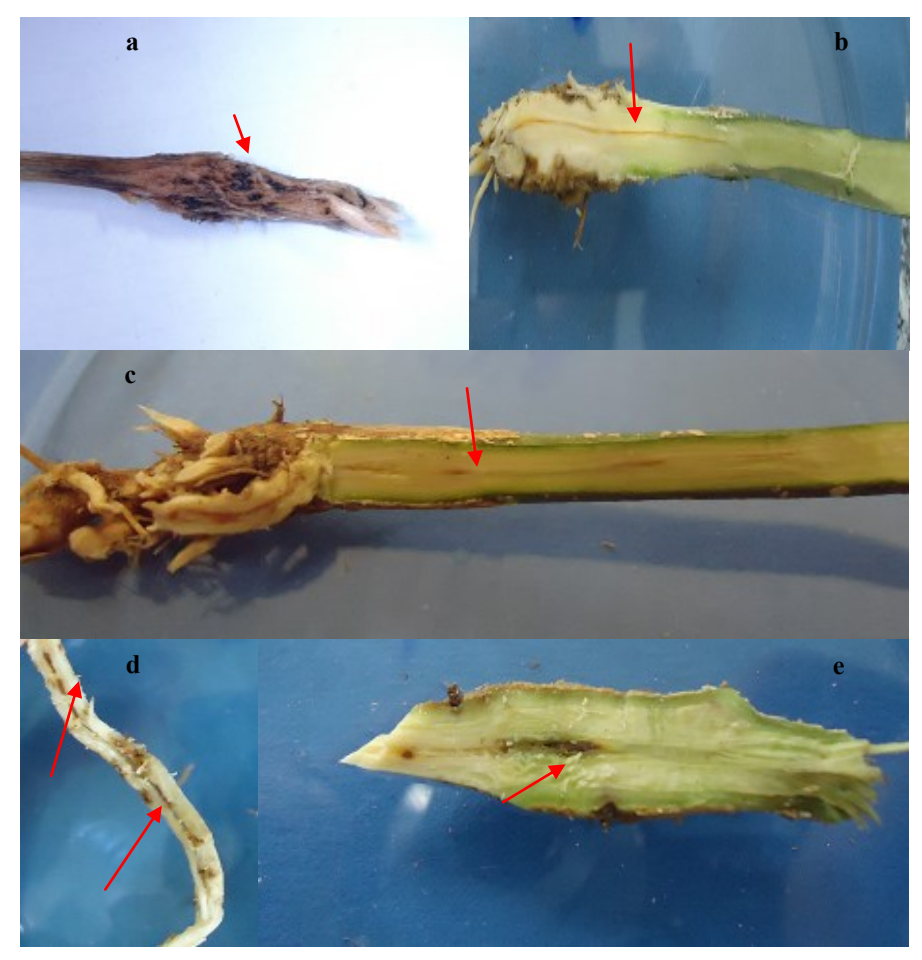
Figure 1 . Disease symptoms caused by Fusarium solani in genotypes of passion fruit plants: a) peeling of the cortex at the stem base of Passiflora ligularis plant; b) internal spot in a passion fruit plant of the hybrid BRS Sol do Cerrado; c) internal spot in root and stem in a passion fruit plant of the genotype M-19-UFV; d) internal spot in root of a Passiflora alata plant; e) internal spot in stem of a Passiflora morifolia plant.

The lesion length data were not subjected to analysis of variance because they did not meet the basic statistical assumptions (normality, additivity,