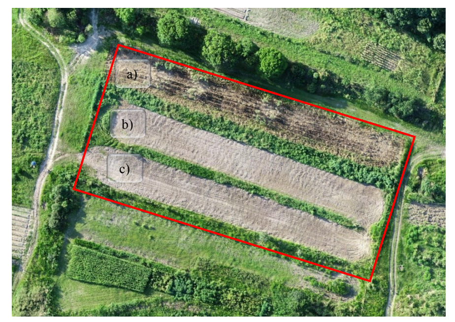
Figure 1 . Long-term Experiment (implemented in 2001), located at the Campus Rural (10°55'24" S and 37°11'57" W) of the Federal University of Sergipe (UFS), in the municipality of São Cristóvão, state of Sergipe, Northeastern Brazil, with soil at the site classified as Ultisol, in the Coastal Tablelands of Sergipe: a) Ultisol under no-tillage management; b) Ultisol under Minimum tillage management; Ultisol under conventional tillage management.

after planting). At this stage, the grains had 70-80% moisture, known commercially as Green corn (GC). The corn cobs were counted and weighed to determine the yield. The plant residues were cut and placed on the soil.