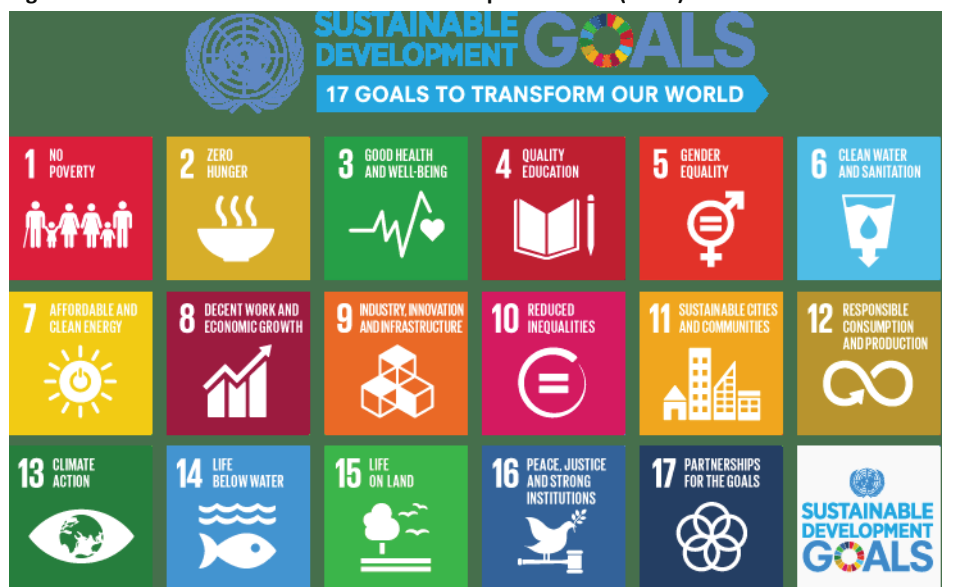
Figure 1: Official icons of the Sustainable Development Goals (SDGs).