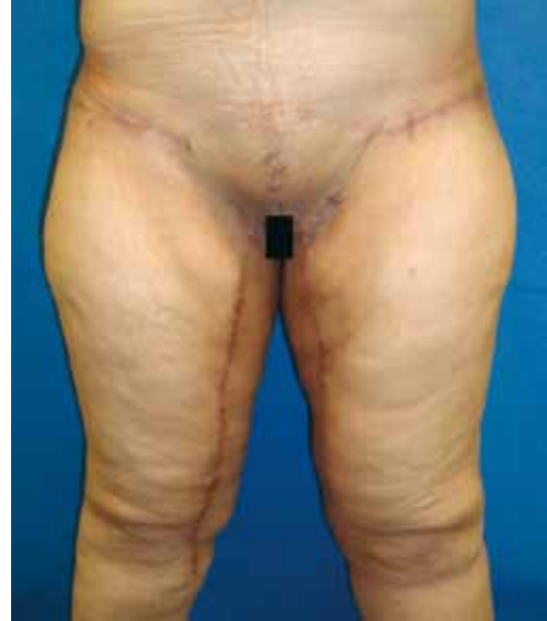
Figure 9 – NOS patient: postoperative period of 180 days.