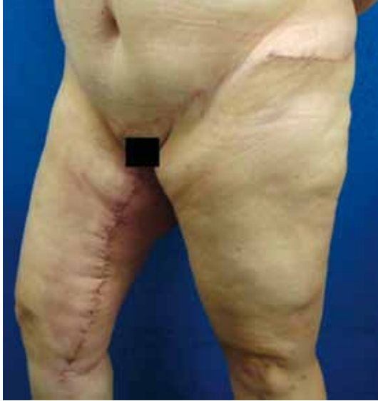
Figure 7 – DF patient: postoperative period of 60 days.