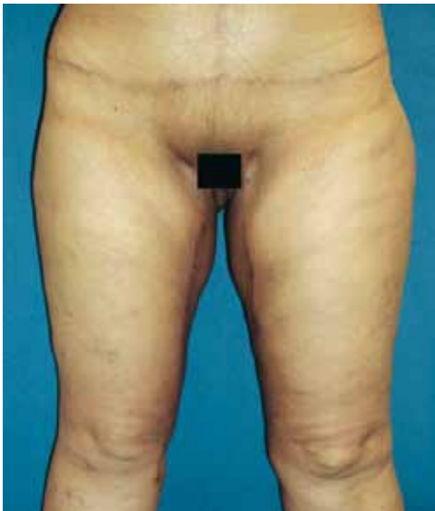
Figure 4 – DLS patient: postoperative period of 180 days.

classified into one of three types, seek surgery to improve physical dynamics as well as hygiene, gain the freedom to wear certain clothing such as long pants, and achieve more pleasurable sexual performance and a balanced hip contour.