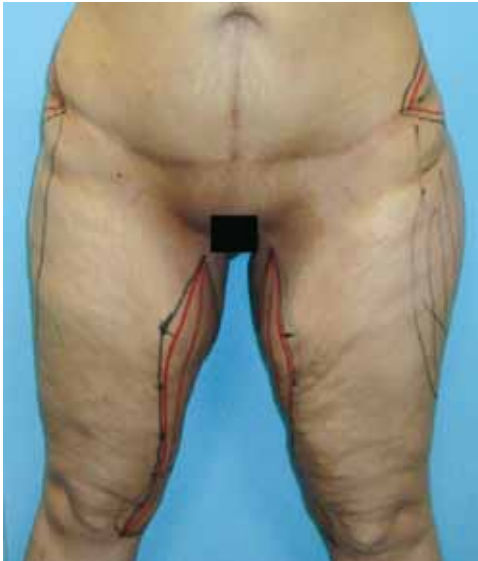
Figure 3 – DLS patient: preoperative surgical marking.