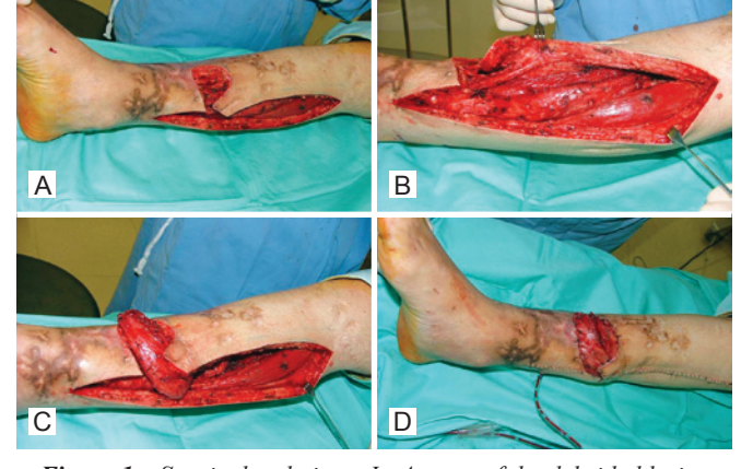
Figure 1 – Surgical technique. In A, area of the debrided lesion and medial lesion in the leg for access to the soleus muscle. In B, exposure and dissection of the soleus muscle. In C, rotation of the medial portion of the soleus muscle and coverage of the lesion area. In D, primary synthesis of the donor area and coverage of the previous exposed area by the reverse soleus muscle.

A 19-year-old male patient had a lesion in the distal third of the right leg that had not healed for more than three years