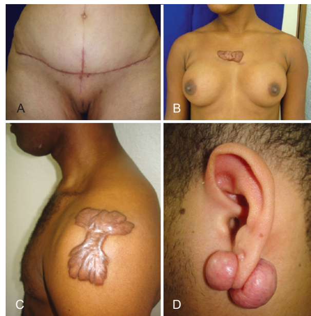
Figure 1 – Fibroproliferative scars. In A , hypertrophic scar (STE = Short-Term Evolution). In B , keloid scar (LTE = Long-Term Evolution). In C and D , mixed scar (IG = Intermediate Group).

A correlation between sun exposure and development of fibroproliferative scars has been observed. It seems that these pathological scars are prevalent in tropical countries 3 . When individuals whose ethnic origin is in colder countries