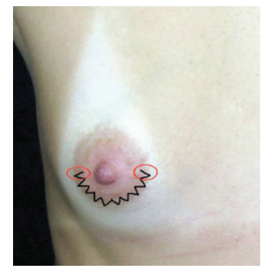
Figure 1 – Schematic drawing of the zigzag marking. Note that the marking is restricted to the skin of the areola and does not extend to the periareolar skin. Details of the marking end, turned to the center of the nipple–areola complex to avoid possible unaesthetic scars in an eventual case of inadvertent extensions of the incision during displacement to insert the implant.

The zigzag approach was conducted for all patients with an indication for periareolar augmentation mammaplasty