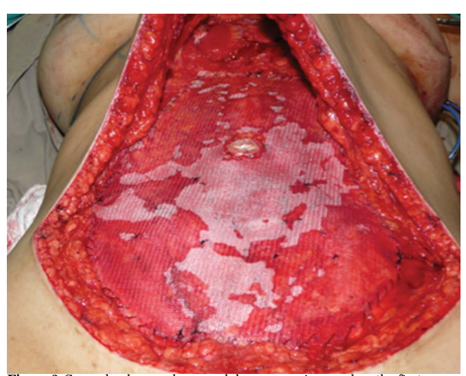
Figure 3. Second polypropylene mesh layer, superimposed on the first, covering the whole of the abdomen.