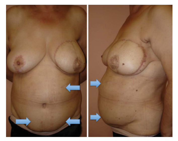
Figure 5. Bulging after late reconstruction with a bipedicled TRAM flap and closure of the aponeurotic defect with a double-layer mesh.

The groups of patients in this study are heterogeneous and ideally should be compared with the same age groups and indicated to undergo the same reconstruction as follows: late or immediate, and monopedicled, or bipedicled. The fact that the reconstruction is immediate or late did not affect the results in terms of abdominal complications either with a monopedicled or bipedicled flap. This finding can be explained by the greater defect in the donor area in bipedicled TRAM flaps.