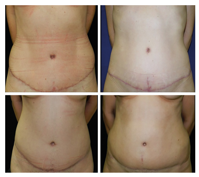
Figure 5. Late post-operative.

and performing circular incisions on the skin of the abdominal flap ^{3-5} .