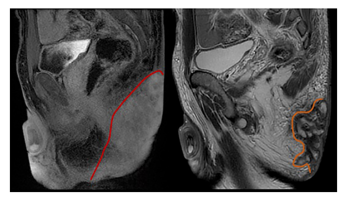
Figure 1. Fat-suppressed gadolinium-enhanced axial T1-weighted MR images (left) and axial T2-weighted (right) showing intense contrast enhancement in the affected region (delimited by the red line) and subcutaneous abscesses forming fistulous tracts (delimited by the orange line).

The imaging results include fistulas, granulomas, abscesses, scar bridges, and dermal and subcutaneous thickening of well-delimited borders<sup>6</sup>. Abscesses are characterized by circumferential morphology in the subcutaneous tissue, with a low signal in T1 and high in T2, with evident contrast enhancement due to the contrast medium and restricted diffusion (Figures 1 to 3). Fistulas in the subcutaneous and dermal tissues of the anal canal and the distal part of the rectum can mimic Crohn's disease or cryptoglandular disease. These diseases can also coexist with HS, which impairs the ability to determine a diagnosis<sup>6,7</sup>.