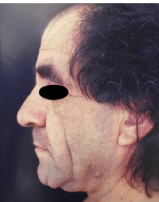
Figure 2. Left: Preoperative frontal view; Right: Preoperative view from profile.