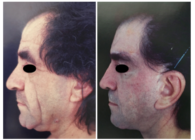
Figure 7. Pre and postoperative profile view.