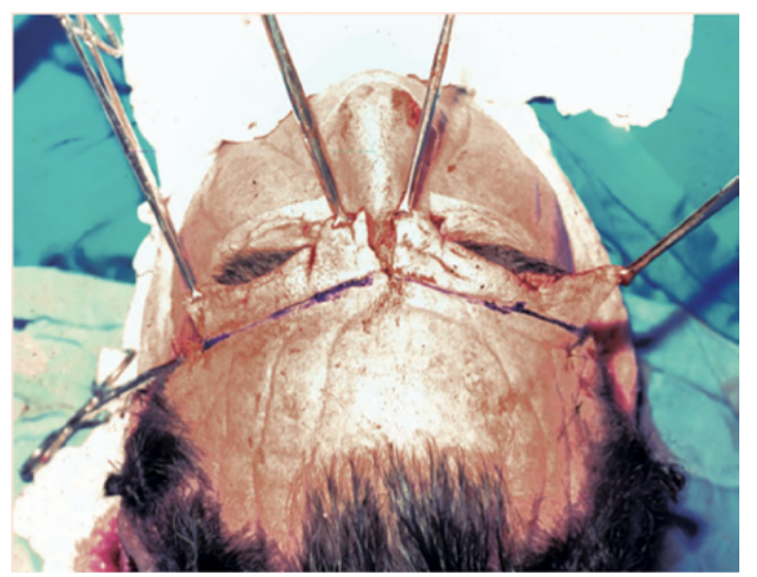
Figure 5. Photo of the technique being performed intraoperatively. Caudal flap traction.

which, being pronounced, required local traction following the same concept used in the upper third. A skin excision was performed on the submentum to treat excess skin in the mentonian region.