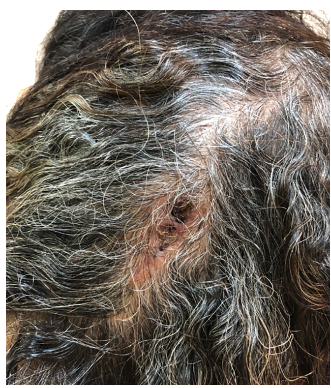
Figure 1. Preoperative.

A 70-year-old female patient living in Rio de Janeiro, the capital, works as a makeup artist, phototype IV, who had a fast-growing scalp nodule in the occipital region (Figure 1).