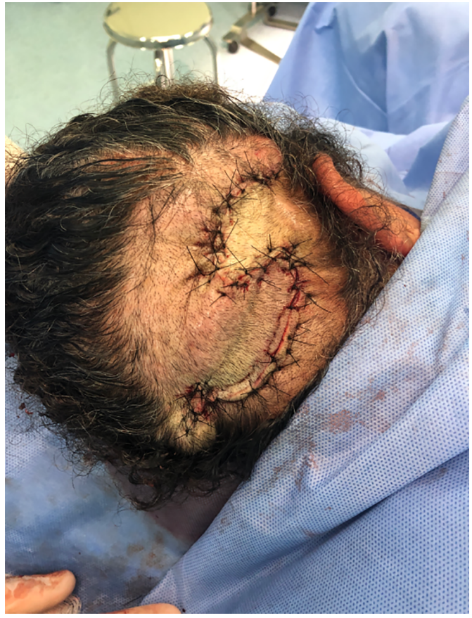
\textbf{Figure 5.} \ \textbf{Immediate post-op.}