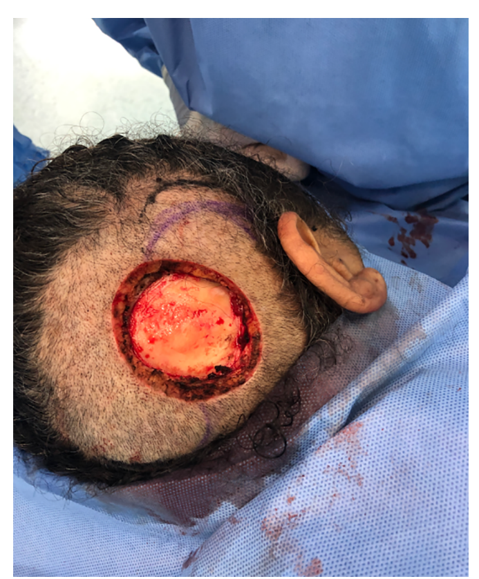
Figure 4. Defect area after deep margin magnification.