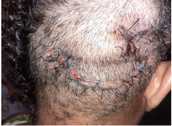
Figure 6. Three-week post-op.

It was decided then scalp flap in rotation, s-shaped, bilaterally to the defect, turning towards the central part with good immediate result, good perfusion and resolution of the defect (Figures 5 and 6). The patient will continue to be monitored in the office in the long term for the possibility of this tumor's aggressive behavior.