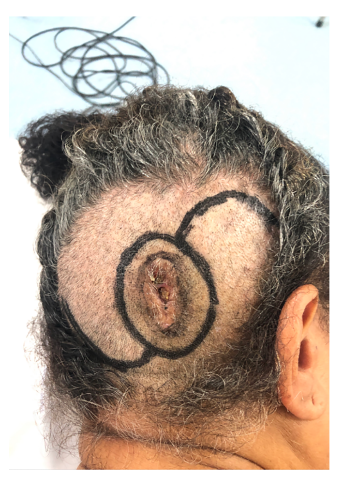
Figure 2. Preoperative: marking and resection with margins of 1cm.

She sought a new dermatologist for rapid growth, recurrence and local inflammatory signs (erythema and pain), where she was treated clinically. The dermatological examination showed a cystic tumor of three centimeters, hyperpigmented and with hyperkeratosis. An incisional biopsy was performed, in which a diagnosis of proliferating trichilemmal tumor was obtained, and was referred to a plastic surgeon to perform a wide excision of the lesion with at least 1 cm margin (Figure 2). A lesion was excised with 1 cm wide margins (Figure 3), followed by freezing by a pathologist who confirmed free margins (Figure 4).