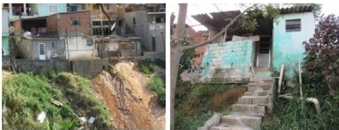
Figure 2 - (Left) Release of wastewater and rainwater on a hillside – Vila Josefina, Franco da Rocha. Source: LabGRis, 2018. (Right) Poor wastewater collection infrastructure – Vila Josefina, Franco da Rocha. Source: LabGRis, 2018.

The continuous release of wastewater directly onto slopes or through leaks from cesspools, besides causing health risks and other negative environmental impacts, is an important indicator of, and contributor to, the prevalence of landslides in areas with precarious settlements. Such situations are evidenced in the various mappings of risks and municipal risk-reduction plans prepared for municipalities in the RMSP, such as Franco da Rocha.