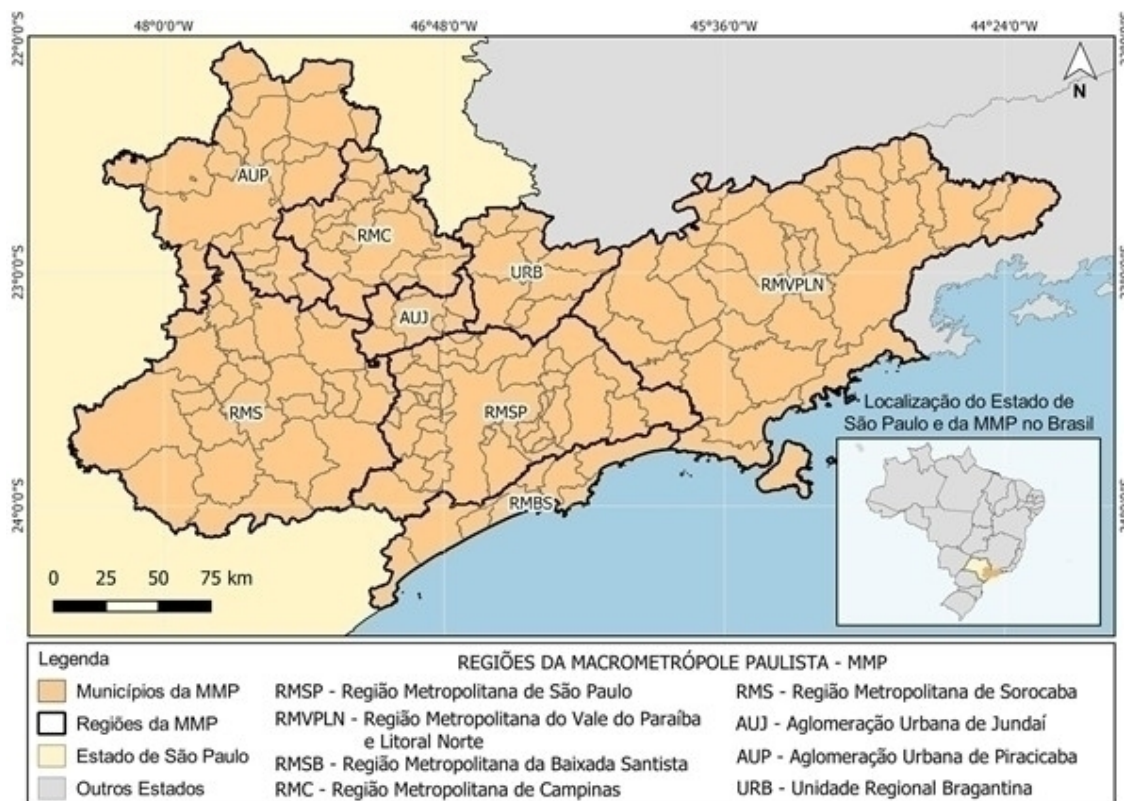
Figure 1 - São Paulo Macrometropolis and its regions.

The São Paulo Macrometropolis is one of the largest urban agglomerations in the southern hemisphere. It includes the Metropolitan Region of São Paulo (RMSP) and those of Baixada Santista (RBS), Campinas (RMC), Sorocaba, and Vale do Paraíba and Litoral Norte (RMVPLN) and the urban agglomerations of Jundiaí (AUJ) and Piracicaba (AUP) as well as the Bragantina Regional Unit (URB), which has not yet been institutionalized (Figure 1).