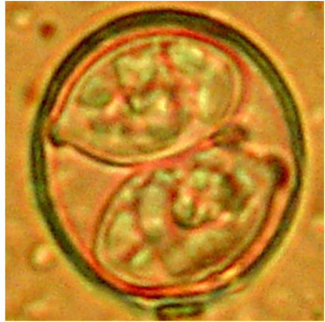
Figure 2. Isospora vanriperorum from Saltator similis . Sporulated oocyst. Saturated sugar solution. 1000X.

yellowish. Micropyle and residuum are absents, but one elliptical polar granule is present. Sporocysts are ovoid, 14.5-20.2 by 8.1-12.5µm (16.3 by 10.8µm), shape index 1.53, with prominent Stieda body, barely discernible Substieda body and residuum centered and granulated.