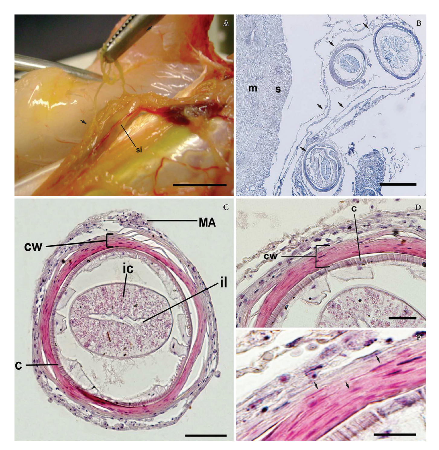
Figure 1. Anatomical view and histopathological aspects of Anisakidae J3 juveniles from the mesenteries of Plagioscion squamosissimus (paraffinembedded). A) Coelomatic cavity of host infected with Anisakidae J3 juveniles (arrow) in the mesenteries, covering the small intestine (si). Bar: 1 cm. B) Histological aspects of AnisakidaeJ3 juveniles (arrows) in the mesenteries of Plagioscion squamosissimus ; the muscularis (m) and serosa (s) layers are visible. The nematode juveniles are not directly attached to the small-intestine serosa and are connected by fibrous host tissue (arrowheads).(TB).Bar: 200 μm. C) Detailed view of a helminth in transverse section showing the intestinal lumen (il), the characteristics of the intestinal cells (ic), the nematode cuticle (c) and the fibrous wall of the cyst (cw) surrounded by macrophage agglomerates (MA). (H&E). Bar: 50 μm. D) Detail of the transverse section showing the histological aspects of the nematode cuticle (c) and the cyst wall (cw), composed of numerous fibroblasts. (H&E). Bar: 20 μm. E) Detail of the cyst wall; numerous fibroblasts are visible (arrows). (H&E). Bar: 10 μm.