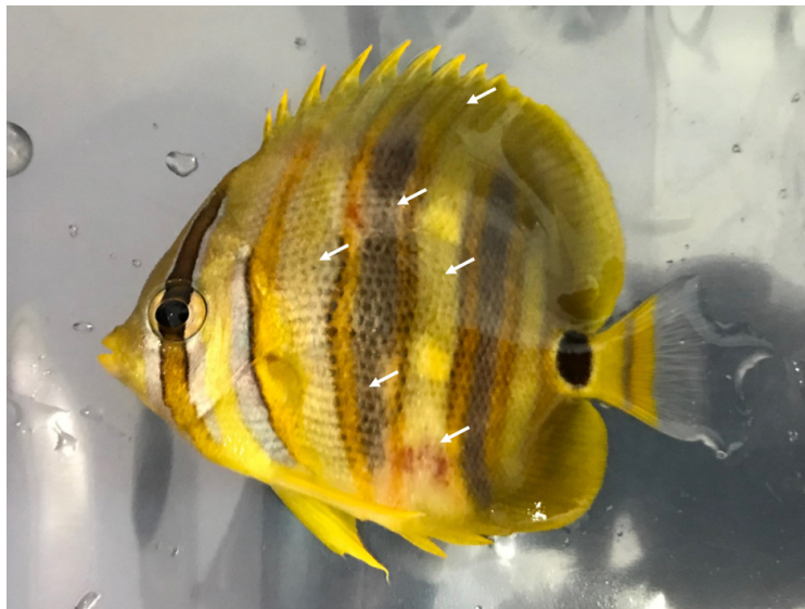
Figure 1. Rainford's butterflyfish ( Chaetodon rainfordi ) parasitized by Haliotrema aurigae .