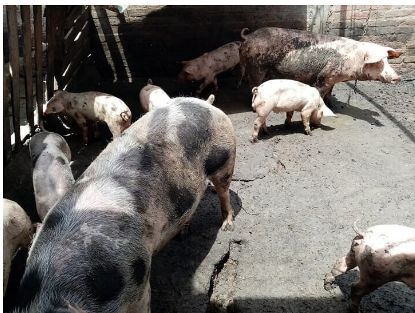
Figure 1. Backyard pigs group raised in open-air pens on farms located at the Bucaramanga Metropolitan Area, department of Santander, Colombia.