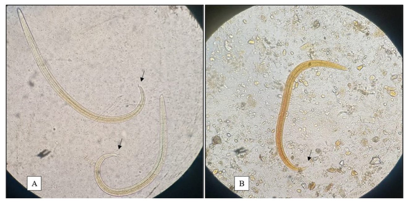
Figure 1. A. First-stage larva of Aelurostrongylus abstrusus found in Cat 1 from the city of Vilhena, Rondônia, using the Baermann technique. B. Aelurostrongylus abstrusus first-stage larva found in Cat 2 using the Hoffman technique. The head is rounded and has a terminal oral opening, while the tail is kinked (S-shaped) with small finger-like projections. Arrows indicate the posterior end in an "S" shape. 40X magnification.

Overall, two out of 101 cats (1.98%) were infected with A. abstrusus . Due to the low occurrence, it was not possible to determine risk factors for aelurostrongylosis in cats. Specifically, one scored positive for lungworm L1 on the Baermann examination (Figure 1A), whereas one scored positive with the Hoffman technique (Figure 1B). L1 were microscopically identified as A. abstrusus according to morphological features (i.e., presence of a terminal oral opening and "S" shaped tail with deep dorsal and ventral incisures, and knob-like appendages). Hoffman technique showed Ancylostoma spp. and Strongyloides spp. eggs in 13.7% (14/102) and 2.9% (3/102) of the cases, respectively. Isospora spp. oocysts were detected in 3.9% (4/102) of the cases.