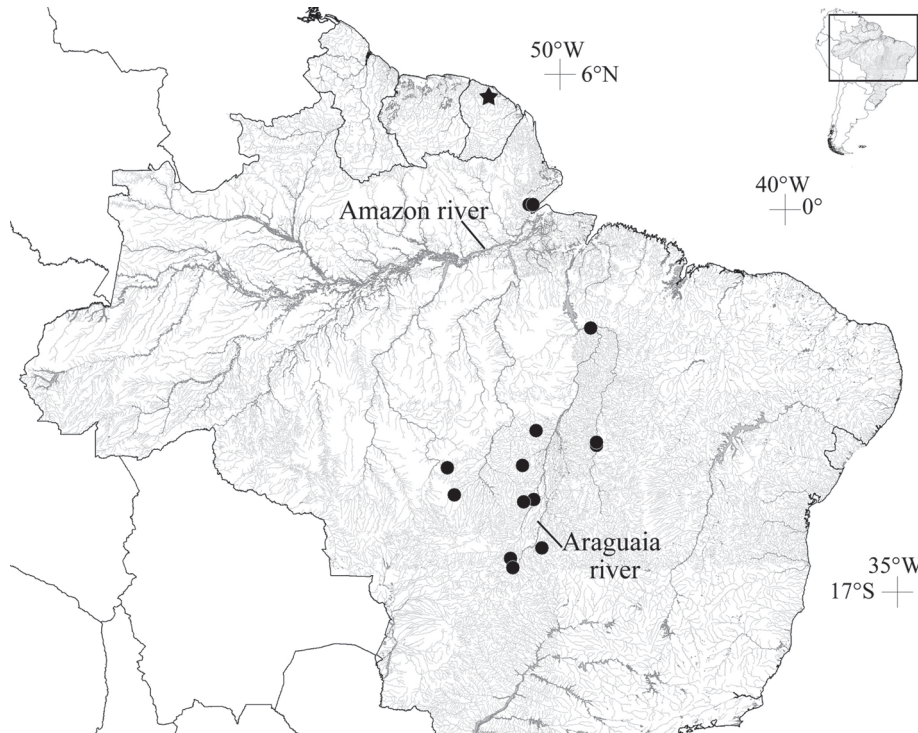
Figure 6. New records of H. ora (dots) in Brazil. The type locality of H. ora is represented by a star in French Guiana. Each dot may represent more than one locality.