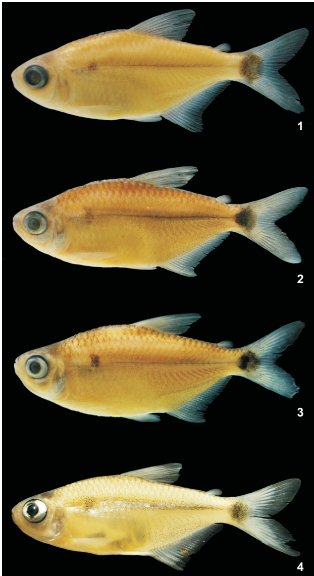
Figures 1-4. Hemigrammus ora from Tocantins-Araguaia River (1 and 2) and lower Amazon River (3 and 4) basins, showing variation on body height and color pattern on preserved specimens: (1) MCP 44533, 27.6 mm SL; (2) MCP 43631, 35.2 mm SL; (3) MCP 43662, 33.1 mm SL; (4) UFRGS 12077, 31.0 mm SL.

other Hemigrammus species (ZARSKE et al. 2006). Additionally, ZARSKE et al. (2006) quoted as diagnostic of H. ora the arrangement of the cusps of the premaxillary teeth of the inner row, in a crescent line; 21 to 24 branched anal-fin rays; 32 to 33 lateral line scales; 10 to 15 perforated scales on the lateral line; body depth 2.94 to 3.44 in SL; and head length 3.42 to 3.96 in SL.