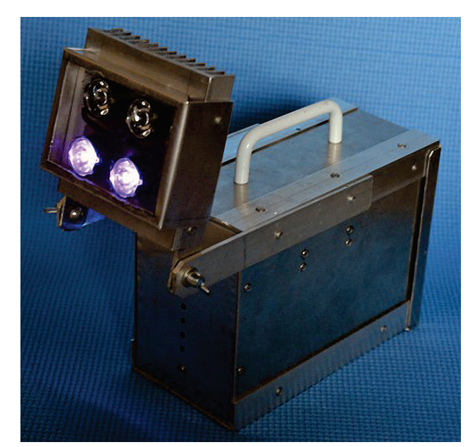
Figure 1. View of the device with the movable head upright and UV LEDs on. Scale: 10 cm.

also preventing a polarity reversal, since the battery can only be introduced into the device in one way. The amount paid for all components used to build the device was estimated on $ 90, quoted in June 2012. The weight of the device with the battery is 3.5 Kg. The voltage and current measurements were made with the ICEL Meter<sup>®</sup> Model MD-6400. Measurements of the waveform and frequency were made with the MINIPA<sup>®</sup> model MO1225 oscilloscope.