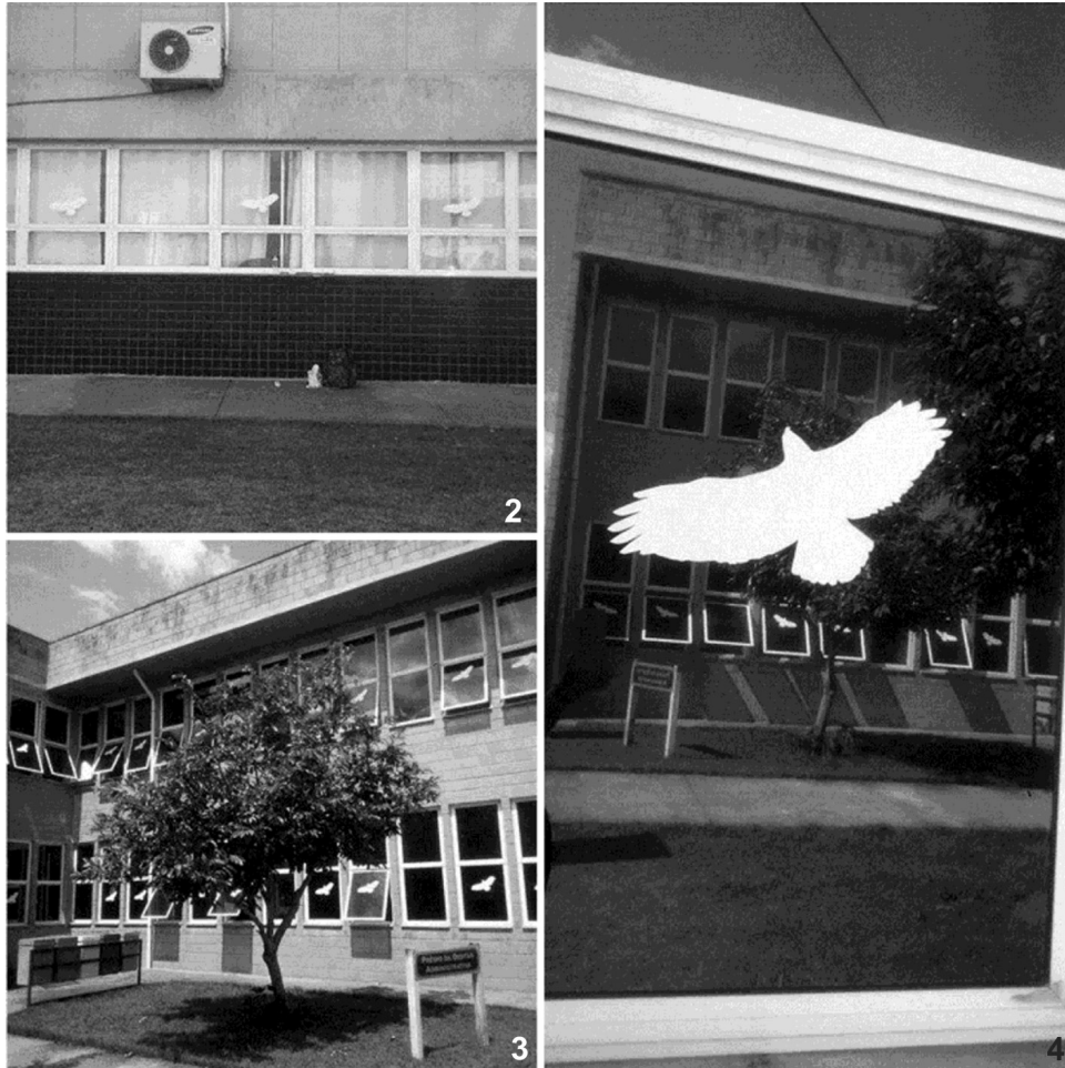
Figures 2–4. Windows of the ATLAB (2) and GAD (3) buildings following application of decals (4). See text for description.

We constructed 154 generalized bird-of-prey decals, 20 × 40 cm (0.08 s.m.), based on the photo ( http://www.ideiasedicas.com/aulas-sobre-aves-falcao/falcao-voando ). It was converted to silhouette-form using Gimp 2.8 to serve as a template that was traced onto adhesive white paper (Fig. S3 – Suppl. material 3). We chose white to be conspicuous against the dark windows. We attached 96 decals to ATLAB and 58 to GAD between March and May 2015 (while continuing to collect data), distributing them evenly by alternating between one or two windows (Figs 2–4). We distributed decals across as much of the exposed area of each building as possible but concentrated on places where the most carcasses were found, whilst access to other areas was restricted.