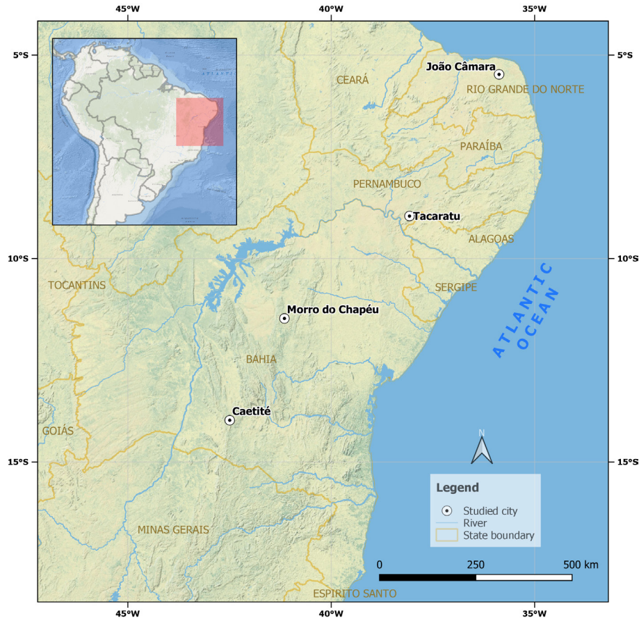
Figure 1. Wind-energy complexes in northeastern Brazil studied for the presence and activity of insectivorous bats from September 2015 to January 2017.

(24 wind turbines), where we selected three sampling points (hereinafter P7, P8, and P9), with two data collection campaigns of three nights of recordings each (Table S1). The predominant vegetation throughout the region is a relatively homogeneous arboreal-shrubby caatinga.