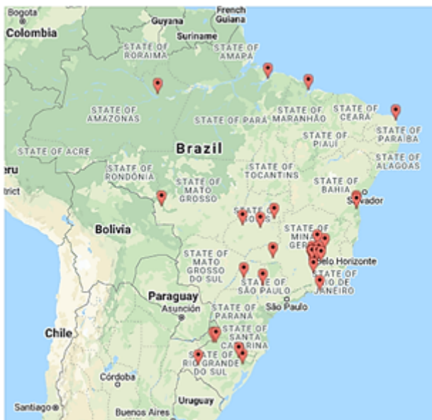
Figure 2 Location of the participants