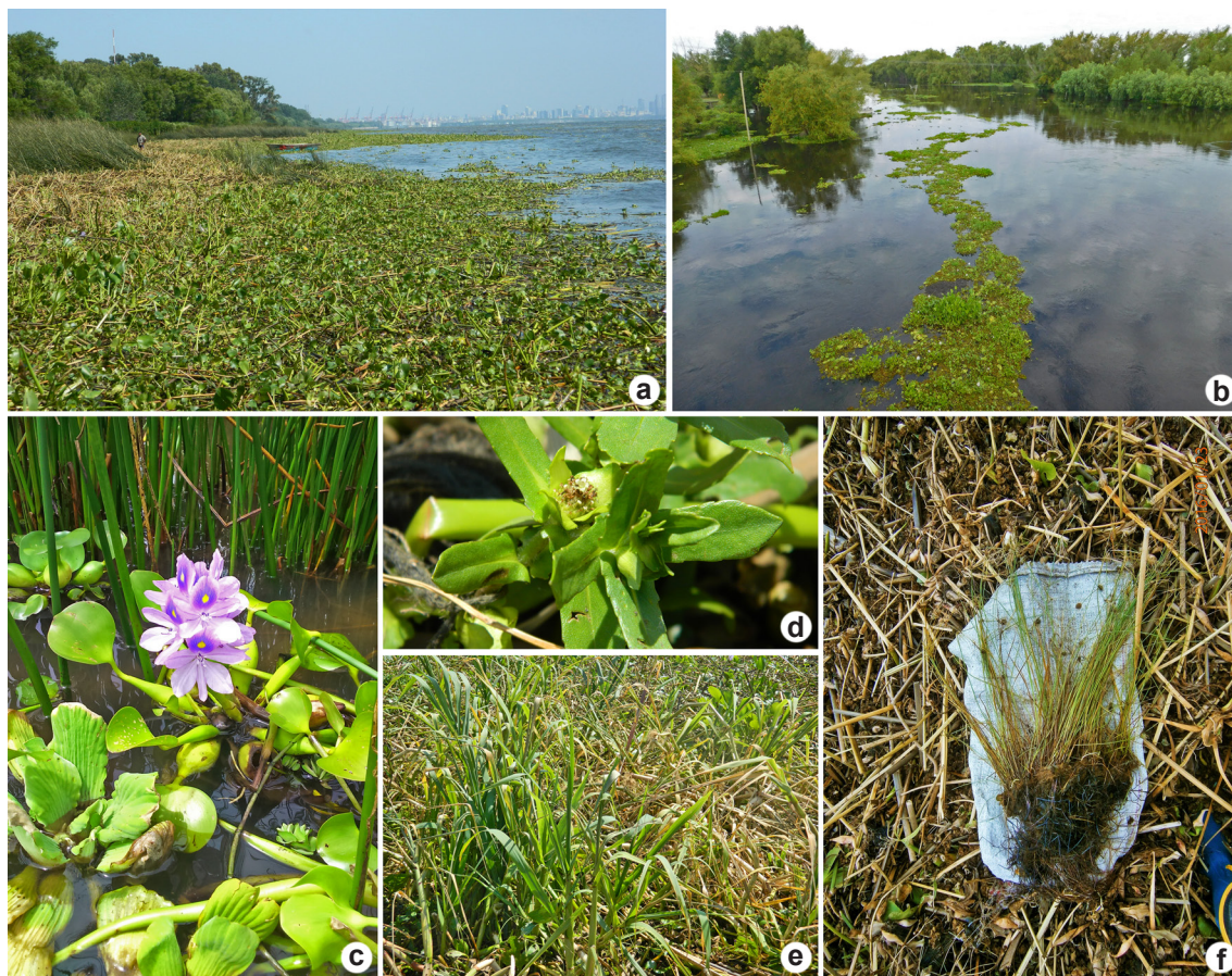
Figure 2 – Photograph of the Eichhornia rafts – a. attached to the Río de la Plata coast in Bernal; b. travelling to the Río de la Plata in the Paranacito river. Plant species of the Eichhornia rafts – c. Eichhornia crassipes ; d. Enhydra anagallis ; e. Panicum elephantipes , forming canutillares; f. Oxycaryum cubense forming incipient soil over the Eichhornia rafts.

added data of the vegetation that arrived to the marine Atlantic coast of the province of Buenos Aires in Punta Médanos, Mar de Ajó, and San Bernardo localities (La Costa district).