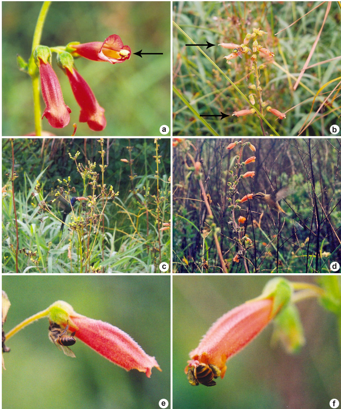
Figure 2 – a-f. Flower characteristics and floral visitors of Sinningia elatior – a. stamens in male phase indicated by a black arrow; b. stigmas in female phase indicated by black arrows and a female of Oxaea flavescens drinking nectar from the base of corolla; c. Eupetomena macroura visiting a flower; d. Phaethornis pretrei visiting a flower; e. Apis mellifera robbing nectar from the base of corolla; f. a female of Exomalopsis fulvofasciata robbing pollen.