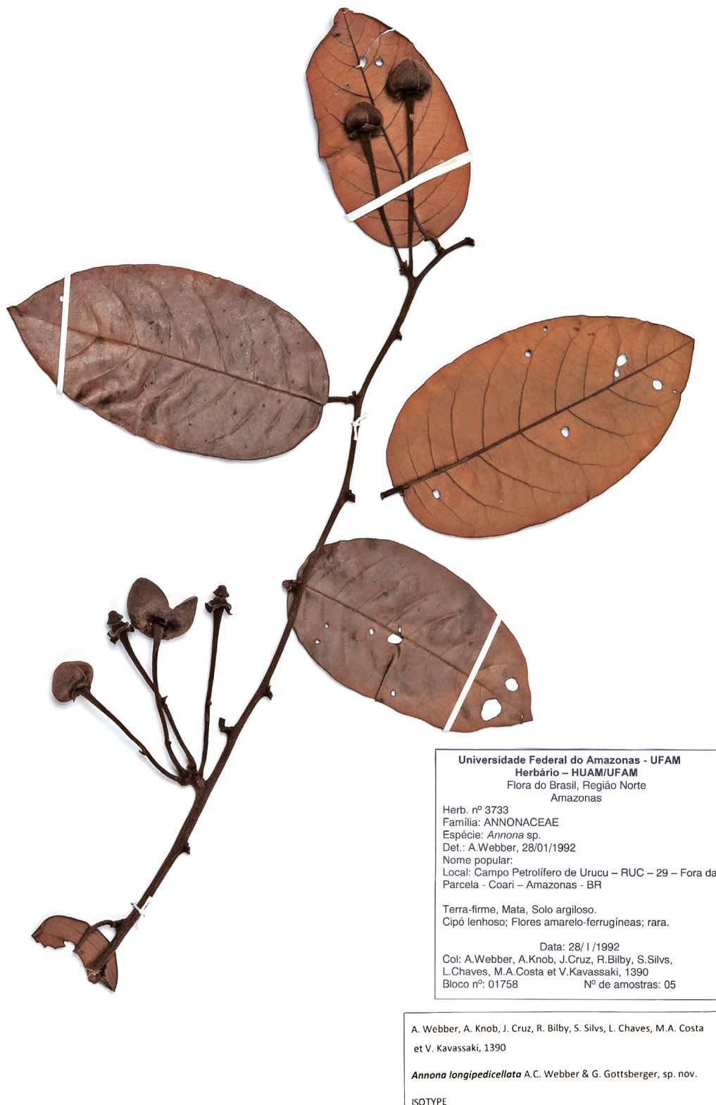
Figure 1 – Voucher specimen of isotype (ULM) of Annona longipedicellata , sp. nov. Note ferruginous hairy flowers and underside of leaves.