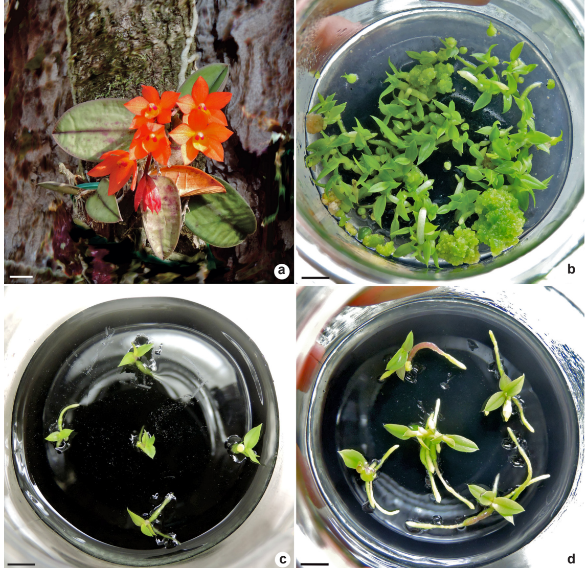
Figure 1 – a. Cattleya cernua ; b. plants 8 months after sowing; c. individualization of plants and start of experiment with different concentrations of macronutrients and sucrose; d. plants after 180 days growing in MS medium with 50% concentration of macronutrients and 30 g L^{-1} of sucrose. Bars = 10 mm.

In order to obtain individuals for conservation purposes, the objective of the present study was to establish optimal conditions for asymbiotic in vitro propagation of C. cernua by evaluating the effect of different concentrations of macronutrients and sucrose on the survival and development of plants. It is expected that reduced mineral nutrients and increased sucrose concentration will contribute to increasing aerial and root systems of plants since the carbon source in the culture medium is