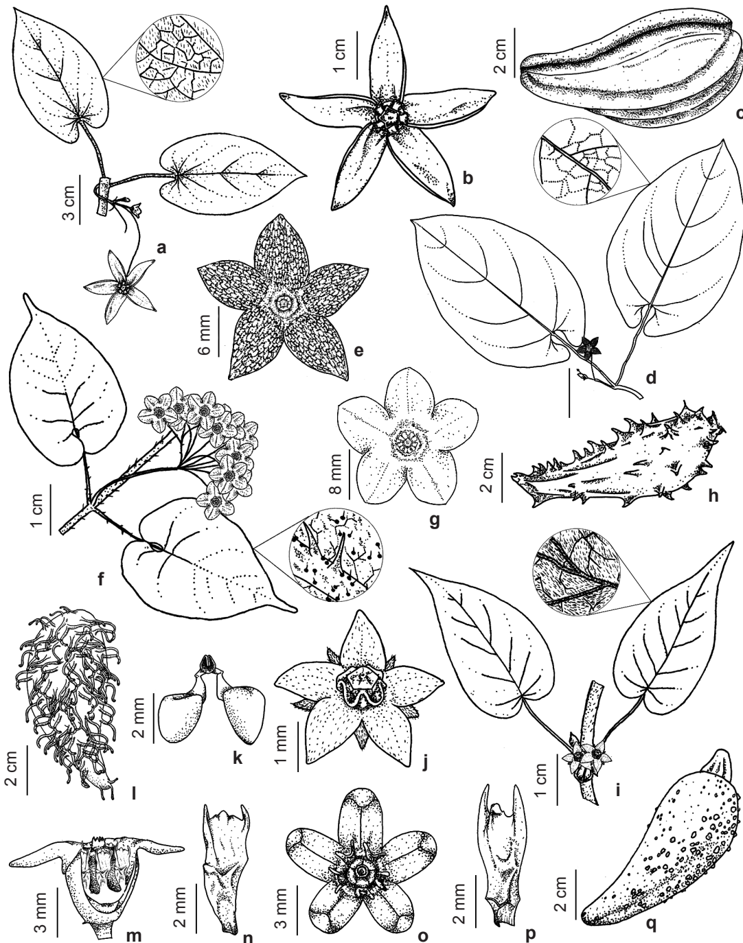
Figure 3 – a-c. Gonolobus rostratus – a. branch and detail of leaf blade; b. flower with rotaceous corolla; c. follicle. d-e. Matelea denticulata – d. branch and detail of leaf blade; e. flower with rotaceous corolla. f-h. M. endressiae – f. branch and detail of leaf blade; g. flower with rotaceous corolla; h. follicle. i-l. M. ganglinosa – i. branch and detail of leaf blade; j. flower with rotaceous corolla; k. retinaculum, caudicles and polínia structures; l. follicle. m-n. M. harleyi – m. flower with campanulate corolla; n. lobate corona with tridentate lobes and subequal denticles in length. o-q. M. nigra – o. flower with rotaceous corolla; p. lobate corona with deeply tridentate lobes and middle denticle shorter than laterals; q. follicle. (a-c. F. Allemão & M. Cysneiros 1001; d,e. M.I.B. Loiola et al. 1527; f-h. M.I.B. Loiola 2838, A.S.F. Castro 2735; i-l. N.C. Rebouças 77, A.S.F. Castro 1608; m,n. F.S. Araújo & S.F. Vasconcelos 1543; o-q. M.A. Figueiredo et al. 163, A.S.F. Castro (EAC 23137).