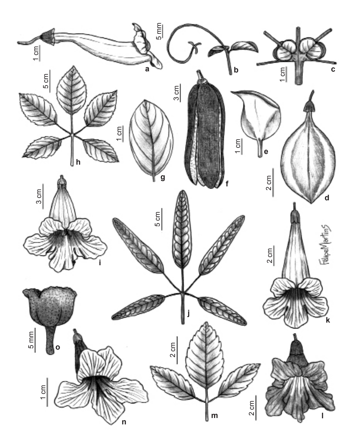
Figure 3 – a-b. Anemopaegma citrinum – a. flower; b. trifid tendril. c-d. Anemopaegma laeve – c. prophylls of the axillary buds; d. fruit. e-f. Dolichandra quadrivalvis – e. calyx; f. fruit. g. Fridericia platyphylla – leaf 1-foliolate. h-i. Handroanthus impetiginosus – h. leaf; i. flower. j-k. Tabebuia aurea – j. leaf; k. flower. l. Tanaecium dichotomum – flower. m-n. Tanaecium parviflorum – m. leaf; n. flower. o. Tanaecium pyramidatum – calyx.