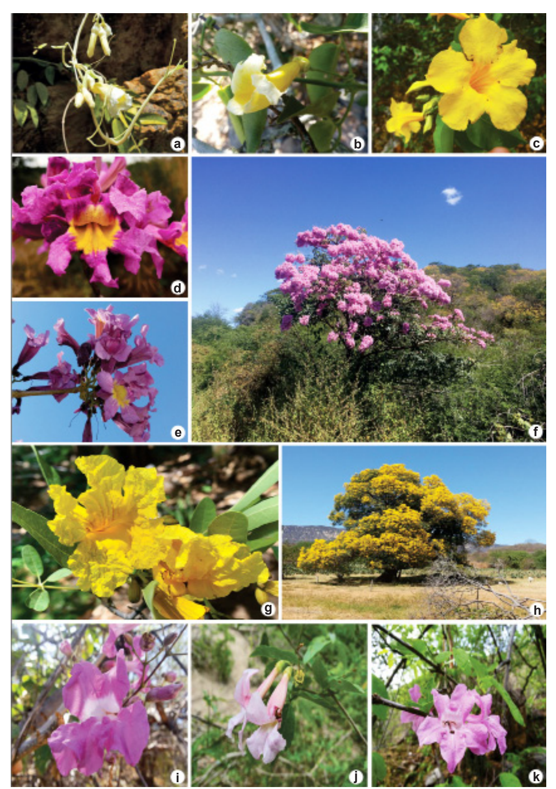
Figure 2 – a. Anemopaegma laeve . b. Anemopaegma citrinum . c. Dolichandra quadrivalvis . d, e-f. Handroanthus impetiginosus . g-h. Tabebuia aurea . i. Tanaecium dichotomum . j. Tanaecium parviflorum . k. Tanaecium pyramidatum .