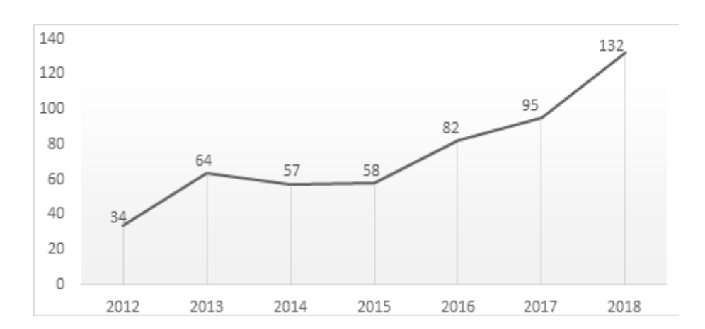
Figure 1 - Distribution of the number of reported cases of gestational syphilis between 2012 and 2018. Anápolis, GO, Brazil, 2020.

Between 2012 and 2018, 522 cases of syphilis in pregnant women were reported, with growth in the number of notifications: from 34 cases (6.5%) in the year 2012 to 132 cases (25.3%) in 2018 (Figure 1).