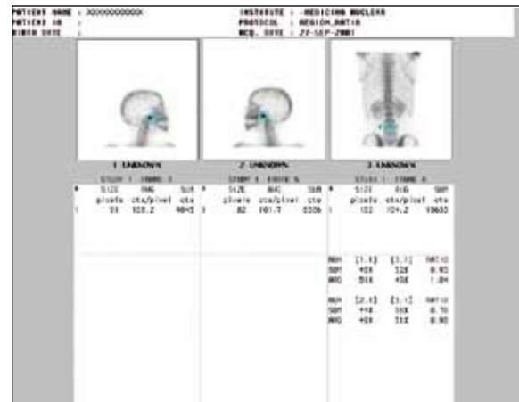
FIGURE 1 - Patient with functional posterior crossbite (scintigraphy images processing): lateral images X fourth lumbar vertebra image, with selected regions of interest (ROIs) and calculated ratio of uptake (RU).

In Figures 2 and 3, it can be observed that the dispersion found was greater in the pre-treatment than in the post-treatment period. This suggests that the UR values of the altered and non-altered sides presented closer values in the post-treatment period.