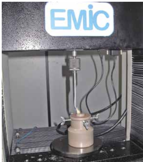
FIGURE 1 - Device fabricated to maintain the specimen stable during the test.

The shear bond strength test results were sub-