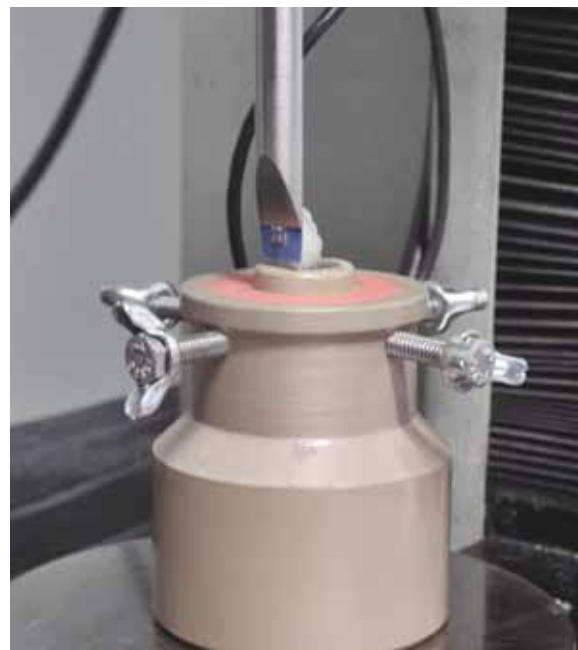
FIGURE 2 - Mechanical test being performed in the EMIC test machine