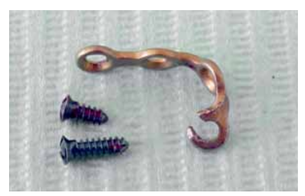
FIGURE 7 - Miniplate and screws surgically removed after 3-months treatment.