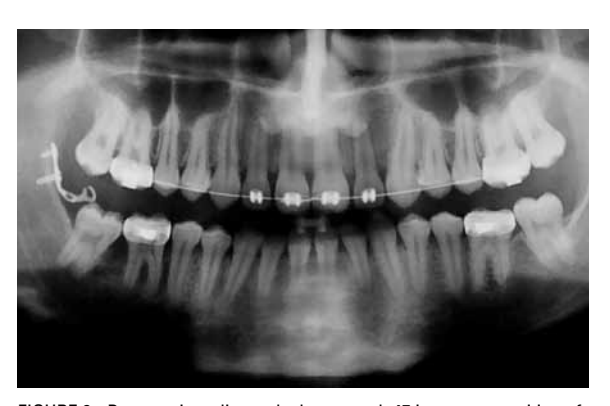
FIGURE 8 - Panoramic radiograph shows tooth 47 in correct position after 3-months treatment.