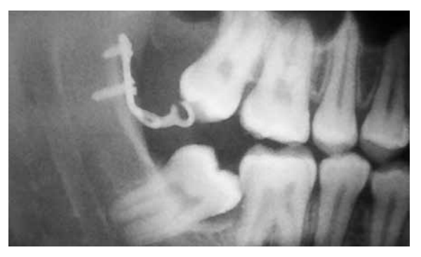
FIGURE 4 - Radiograph obtained immediately after miniplate fixation and before orthodontic movement was initiated.