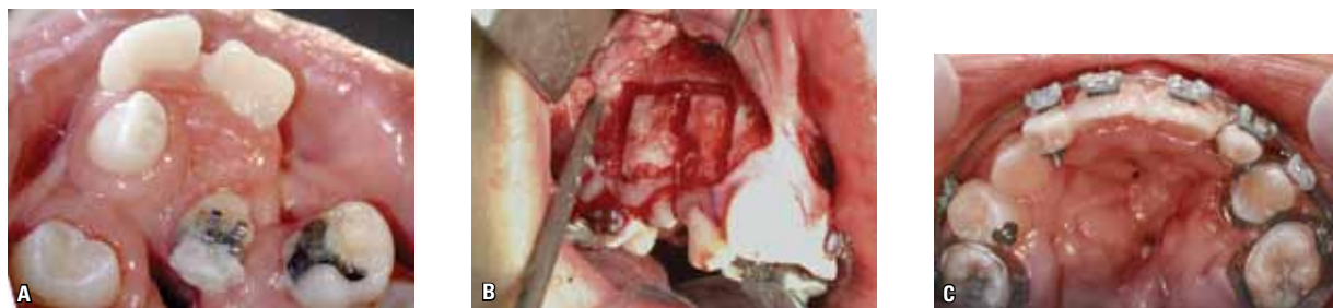
FIGURE 4 - Pre-corticotomy (A), reshaping of dental arch with buccal corticotomies (B), post-corticotomy (C).