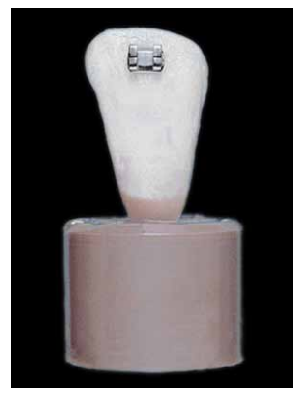
FIGURE 5 - Specimen with bracket bonded to buccal surface.

In the groups using Concise composite no light curing was performed as this is a self-curing material.