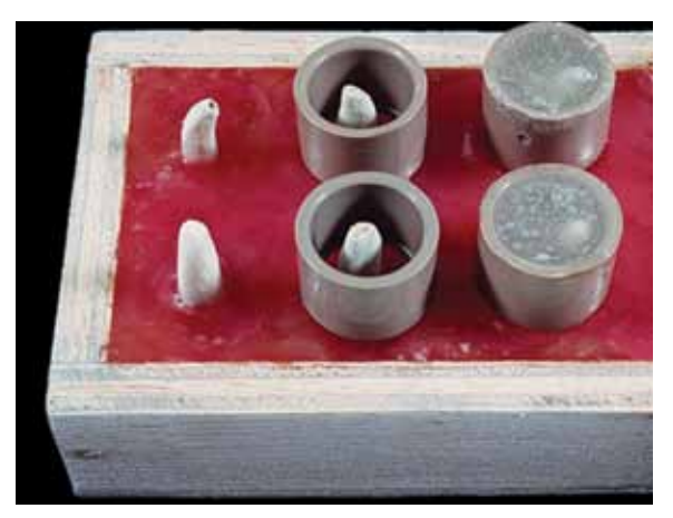
FIGURE 1 - Steps taken to insert bovine teeth in PVC tube.

In the groups using Transbond XT, bonding was light cured for 40 seconds, i.e., 10 seconds on