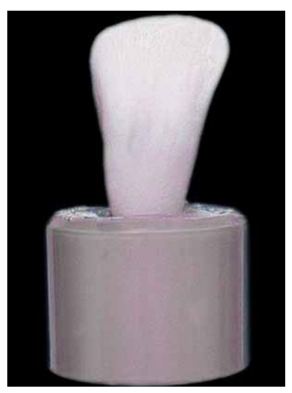
FIGURE 2 - Bovine tooth inserted in PVC tube.

each surface (mesial, distal, incisal and gingival) as close as possible to the base of the bracket with a halogen light unit XL 2500 (3M/ESPE, St. Paul, USA) with 500 mW/cm<sup>2</sup> power. This light intensity was verified prior to each light curing session with a radiometer (Demetron, Danbury, USA).