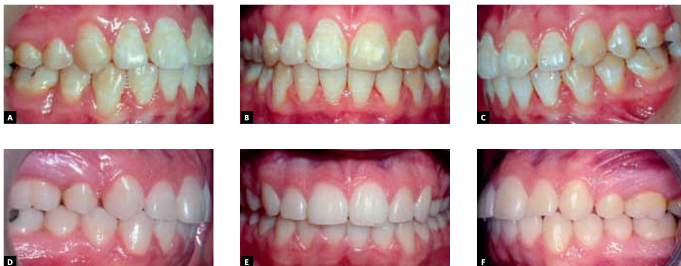
Figure 3 - A, B, C) Finalization with first permanent molars in Class III relationship. D, E, F) Finalization with first permanent molars in Class II relationship.