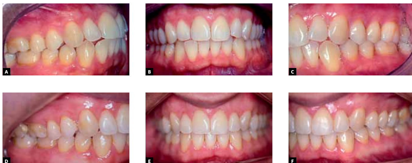
Figure 1 - Patient presenting a Bolton discrepancy with anterior excess. Treatment performed with extraction of only a lower permanent incisor.