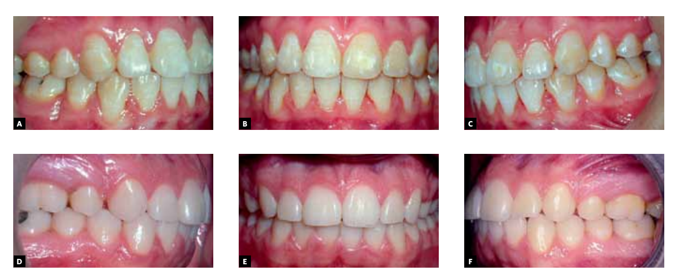
Figure 3 - A, B, C) Finalization with first permanent molars in Class III relationship. D, E, F) Finalization with first permanent molars in Class II relationship.