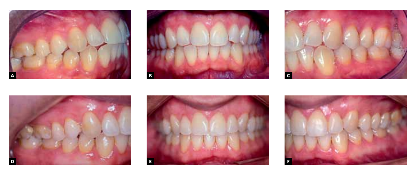
Figure 1 - Patient presenting a Bolton discrepancy with anterior excess. Treatment performed with extraction of only a lower permanent incisor.