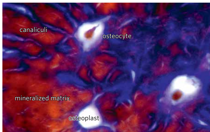
Figure 2 - The osteocytes have many cytoplasmic prolongations, which intercommunicate with the mineralized matrix with other 20 to 40-50 cells and they detect minimal structural deformations and act as mechanotransducers. They occupy lacunae known as osteoplasts and the prolongations spread out as canaliculi, where mediators circulate in a tissue fluid, which performs ionic exchange with the mineralized extracellular matrix (Mallory, 100X).

The osteocytes form a three-dimensional network with each cell communicating with other 40-50 by numerous cytoplasmic processes arranged like a real neural network. This communication is by cell contact and interaction, but particularly by mediators released by osteocytes in different amounts depending on the mechanical stimulus captured. Bone deformation by compression and