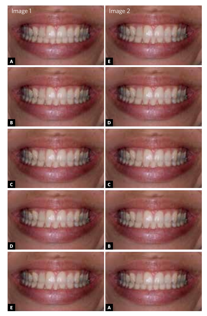
Figure 2 - Modified images assessment. Image 1: A ) With four incisors; B ) without any alteration as regards the width of the three remaining incisors.; C ) with increase in the three mandibular incisors with the same proportion; D ) with a mesiodistal increase in the central incisor and no alteration in the lateral incisors; E ) image with a mesiodistal increase in the lateral incisors and the central without any alteration. Image 2: E ) image with a mesiodistal increase in the lateral incisors and the central without any alteration; D ) with a mesiodistal increase in the central incisor and no alteration in the lateral incisors; C ) with increase in the three mandibular incisors with the same proportion; B ) without any alteration as regards the width of the three remaining incisors; A ) with four incisors.

One of the options widely disseminated in the literature for the treatment of anterior mandibular crowding is the extraction of a mandibular incisor. In spite of being an extensively practiced procedure,