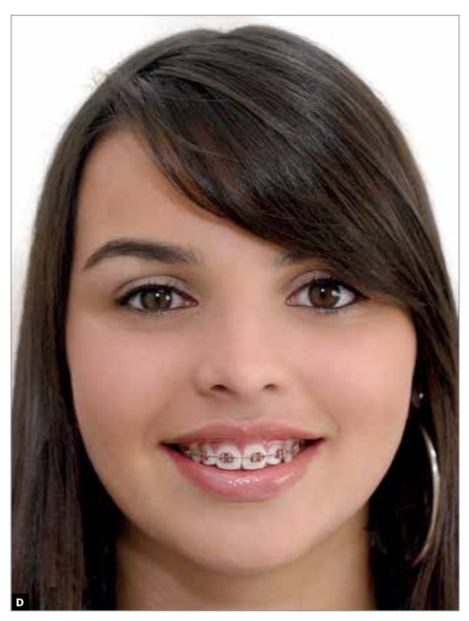
Figure 3 - A) Smile with ceramic brackets (CB). B) Metal brackets + gray ligatures (MB + GY). C) Metal brackets + green ligatures (MB + GN). D) Metal brackets + red ligatures (MB + R).