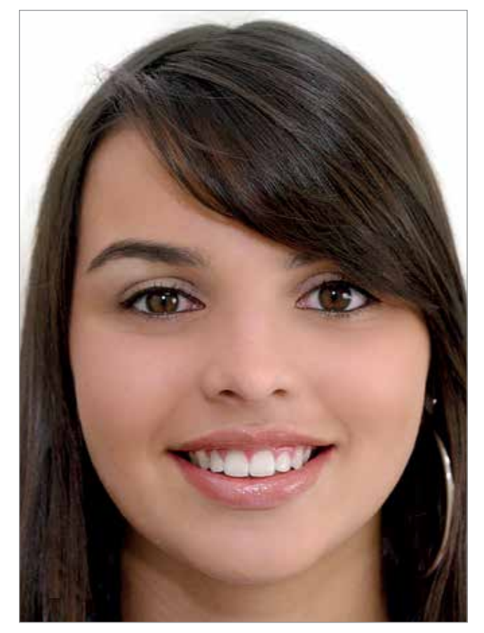
Figure 2 - Smile without brackets (NB).