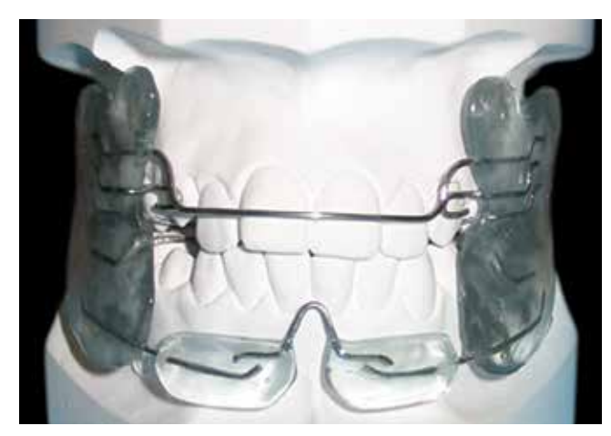
Figure 1 - FR-2 appliance: Frontal and lateral views.

Impressions were taken of the upper and lower dental arches, reproducing all the teeth, alveolar process and buccal groove of the oral cavity for each patient. The casts were made with alginate, and the impressions were immediately poured with plaster, manipulated 30 seconds in a vacuum spatula (Polidental), followed by the use of a vibrating table (Knebel). The record of the patient's occlusion was performed by means of two folded wax sheets subsequently used for proper model clipping. A total of 54 pairs of models were analyzed, obtained from 18 patients at T_1 (before treatment); T_2 (after removal of FR-2), and T_3 (7.16 years on average, after treatment with FR-2).