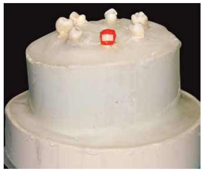
Figure 1 - Mounting the teeth with acrylic resin to the PVC bases.

Using self curing acrylic resin, each tooth was mounted in two PVC bases with different diameters, so that the buccal surface of each tooth formed a 90 degree angle with the acrylic base (Fig 1). This was necessary to standardize the traction tests in the universal testing machine.