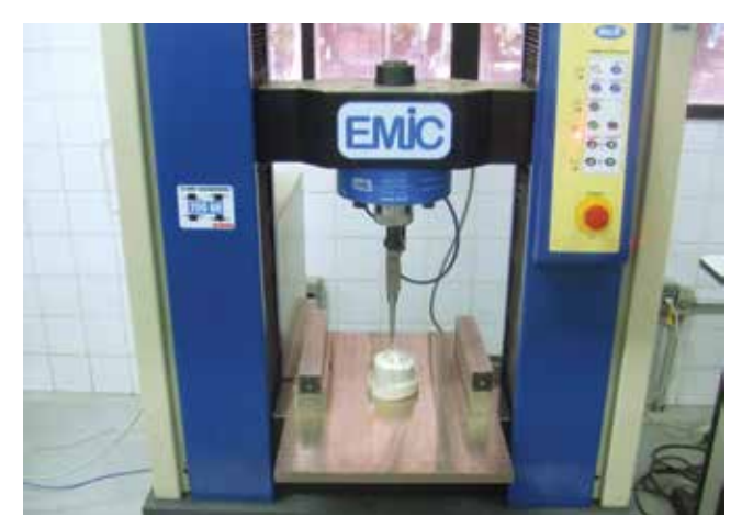
Figure 3 - Emic DL2000 universal testing machine.

The results (Table 2 and Fig 4) showed that there was a statistically significant reduction on the bond strength when compared to the Control group (19.52 kgf) and to the group where bonding was performed 24 hours after bleaching (12.31 kgf). When the bracket debonding strength was confronted with the Control group and the group where bonding was performed seven days after bleaching (18.44 kgf), it was noticed that there was no statistically significant differences.