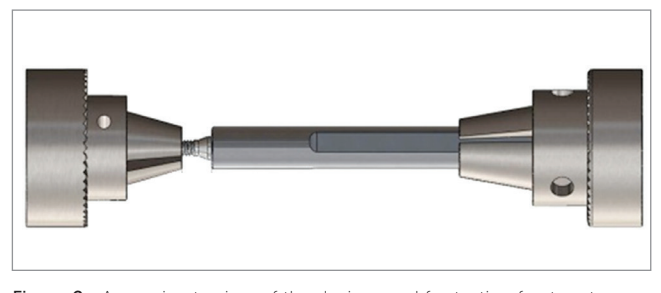
Figure 2 - Approximate view of the device used for testing fracture torque, showing one MI attached to one grip and the insertion-removal key attached to other.