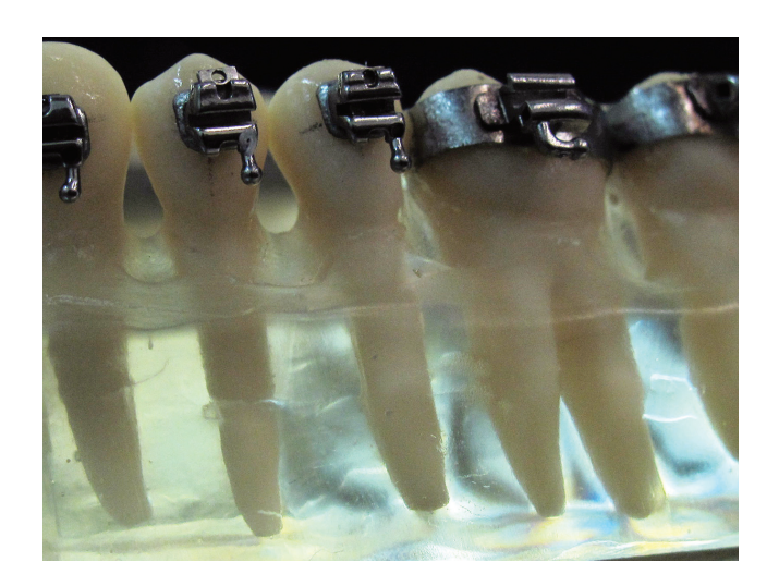
Figure 1 - Photoelastic model without residual tension.

Photographs were taken based on the same criteria for both groups so as to avoid potential interference from other variables. All polariscope components remained within the same distance. Angling with the