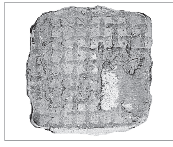
Figure 4 - After removal of tooth structure.