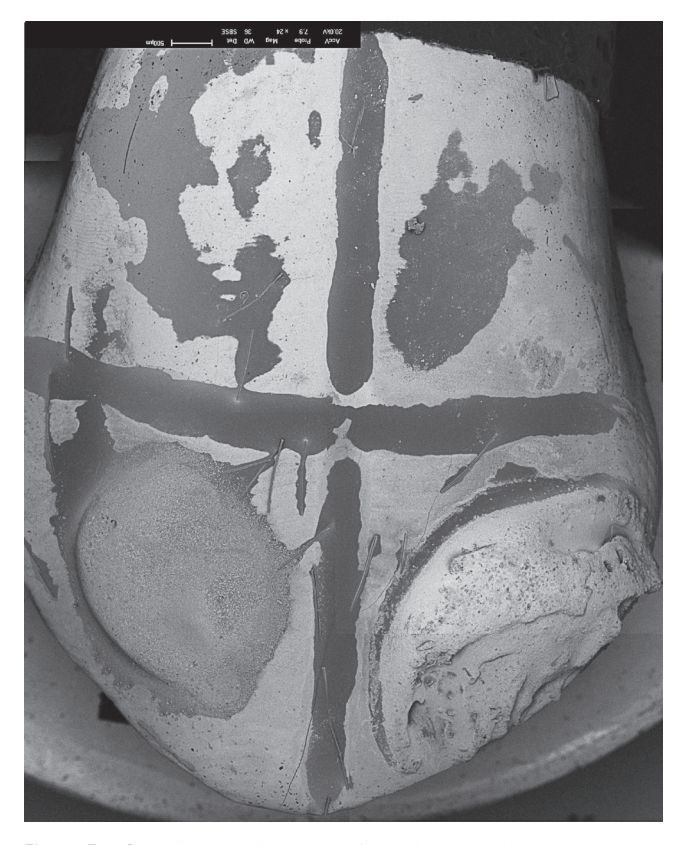
Figure 3 - Control sampl: In upper left quadrant, etching; in upper right quadrant, etching + bonding agent; in lower left quadrant, etching + bonding agent + conventional resin; in lower right quadrant, etching + bonding agent + pigment resin.