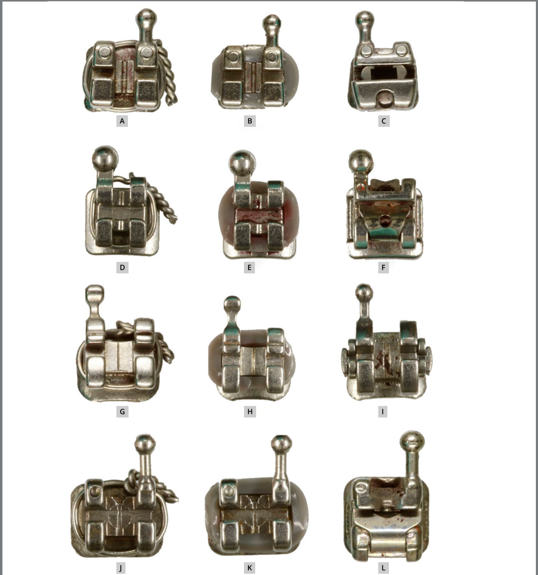
Figure 1: Study groups, in relation to commercial brand and ligature type. Legends: A) Abz-Met; B) Abz-Ela; C) Abz-SL; D) Mor-Met; E) Mor-Ela; F) Mor-SL; G) 3M-Met; H) 3M-Ela; I) 3M-SL; J) GAC-Met; K) GAC-Ela; L) GAC-SL.